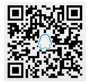
Exosome Research Exchange Group